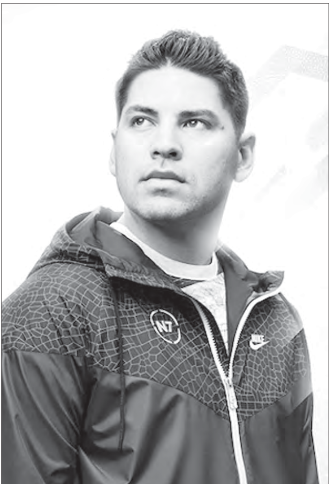
Ellsbury in Nike N7 Dragonfly apparel.

Jacoby was a four-year letterman in football and baseball at Madras High School.