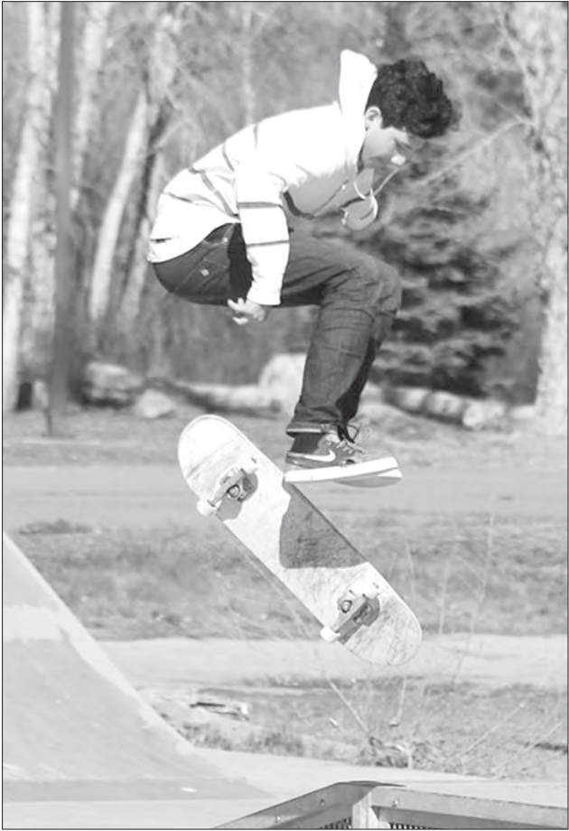
Skateboarder, basketballers and others gathered at Elmer Quinn Park last week for the Smoke Free Park event, hosted by Warm Springs Prevention.