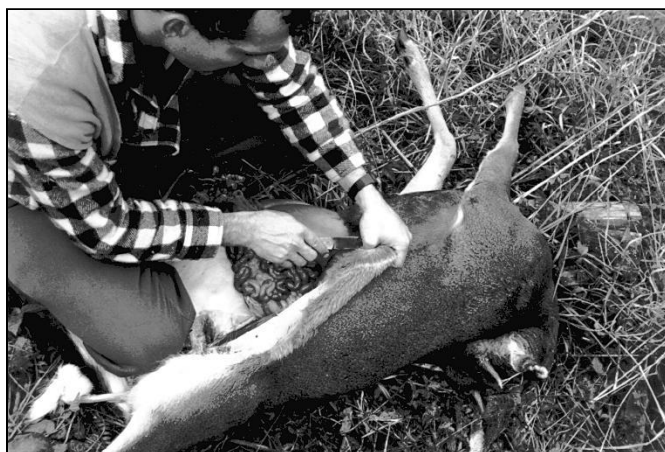
Figure 5. Roll the viscera out onto the ground.