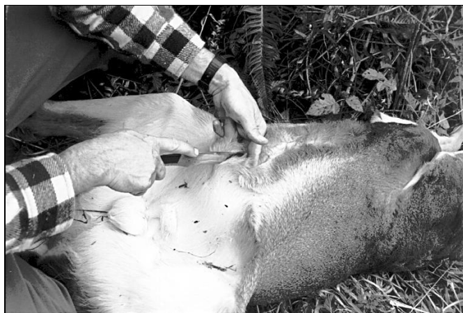
Figure 3. Cut the belly muscle without puncturing the intestines or rumen.