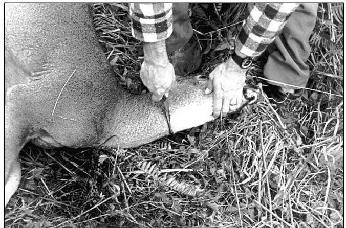
Figure 2. If you are not interested in a trophy, cut the throat below the jaw, severing the arteries and veins.