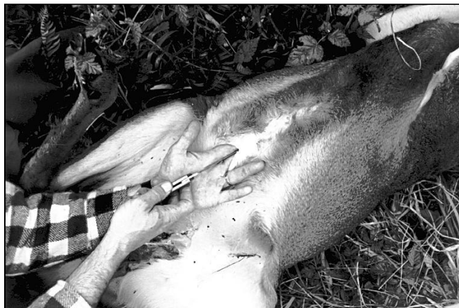
Figure 4. Make a small incision in front of the groin.