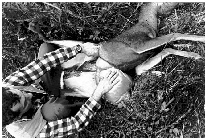
Figure 6. Reach inside and cut through the diaphragm.