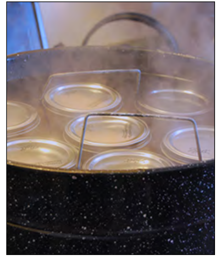
Start timing when the water reaches a full, rolling boil.