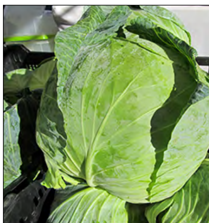
Select tender vegetables without blemishes or mold.