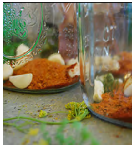
Place flavorings at the bottom of a clean, suitable container.

Caution: Do not use lime sold at garden centers or lumberyards.