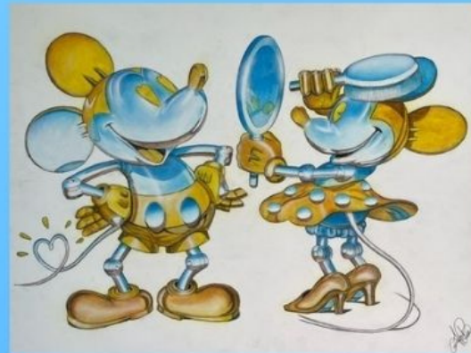
Sorayama painting by Travis R. Bobb Judges Choice Contemporary Art 2022